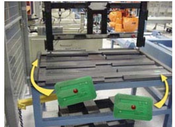
The UHF radio-frequency identification (RFID) tags applied to opposite sides of the pallet

To provide real-time visibility of pallets in circulation, each pallet is outfitted with a ruggedized and encapsulated IPICO Dual Frequency tag that would remain with it for its entire lifetime – in many cases 7 years or more. Instead of mounting these tags to the exterior of the pallet (as is necessary with bar codes due to the line-of-sight requirement), engineers at IPICO Inc. developed a design whereby a single IPICO Dual Frequency tag is encapsulated and 'snapped' into a recessed slot in the structure of the pallet. With typical UHF RFID Tags, two to four tags are required and embedded inside opposite corners of the pallets to ensure that regardless of orientation on the conveyer, one tag will be picked up. Once installed, the tags can be written to with information and read by the antenna. When the pallets complete a cycle, the tags are cleared and rewritten.