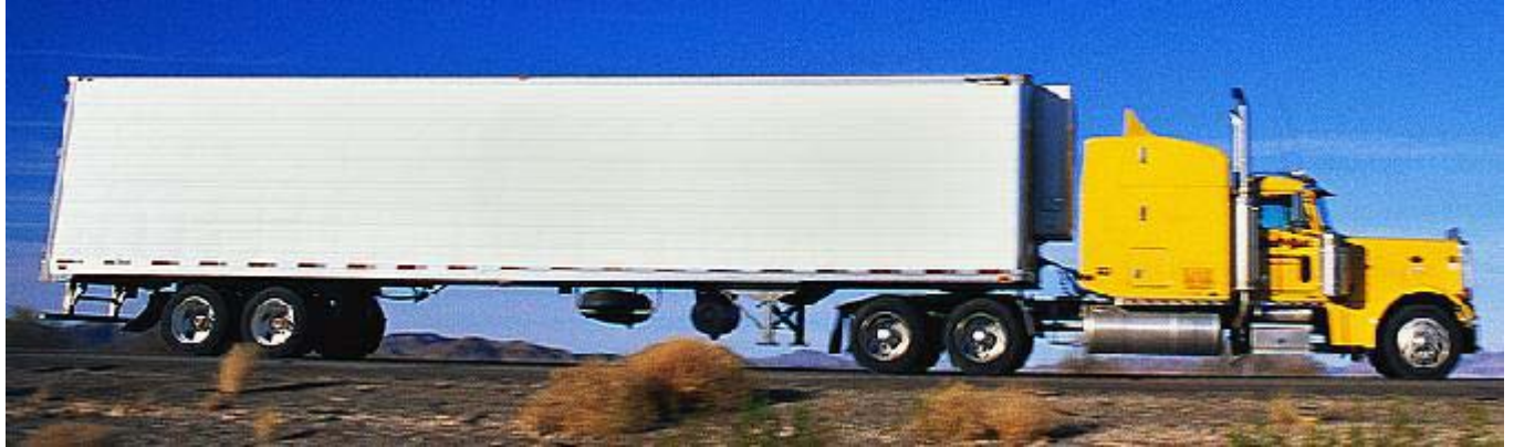
Refrigerated truck bringing fresh produce to market may pass 3 or 4 time and temperature zones

GPS field location where it was picked. This level of traceability allows for easier identification of contaminated product lots, allowing management action with speed and precision, which will help keep them from reaching the consumer and contain costs. Additionally, the solution increases the velocity of product through the food chain, optimizing freshness.